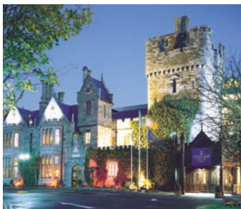
Clontarf Castle Hotel, Dublin

Enjoy a castle hotel stay in Dublin with this program. Peak season supplement to Tier 1 prices are only $4 per person per night.