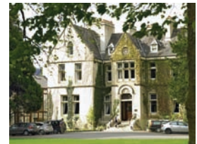
Cahernane House Hotel, Killarney