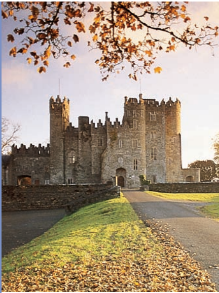
Stay at Kilkea Castle Hotel (Tier 2)